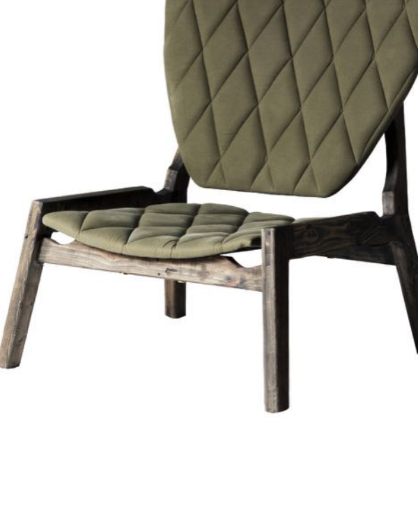
Iceland 26 The "fjörur" chair is designed by Hogni Stefan and manufactured by "Arctic Plank"