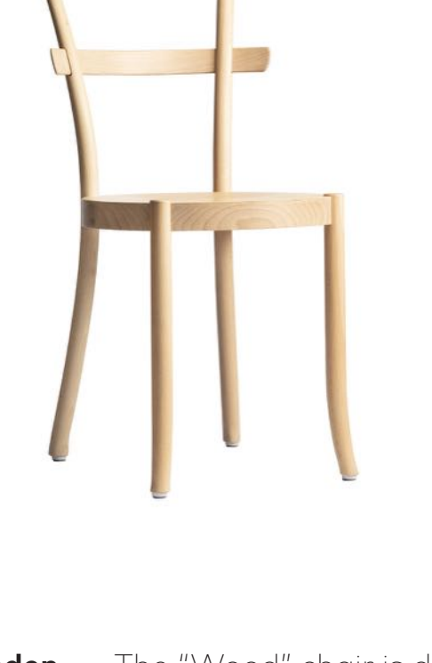
Sweden 42 The "Wood" chair is designed by Åke Avelsson and manufactured by "Garsnäs"