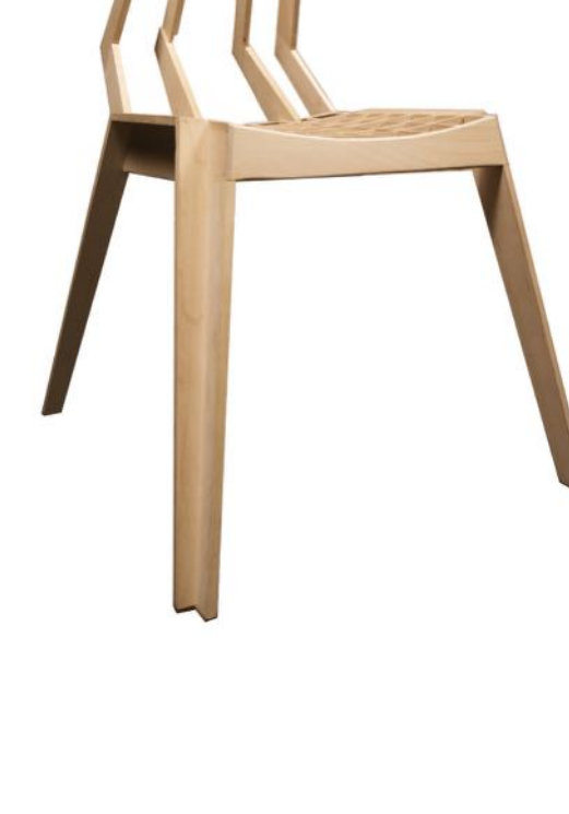
Norway 35 The "Sit" chair is designed by Jone Myking and manufactured as a prototype