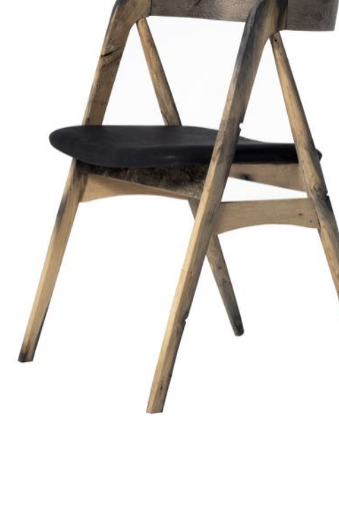
Iceland 27 The "vik" chair is designed by Hogni Stefan and manufactured by "Arctic Plank"