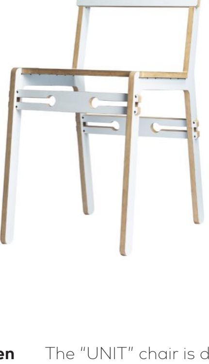
Sweden 46 The "UNIT" chair is designed by Andreas Renfeldt and manufactured by "Crap Creatives"