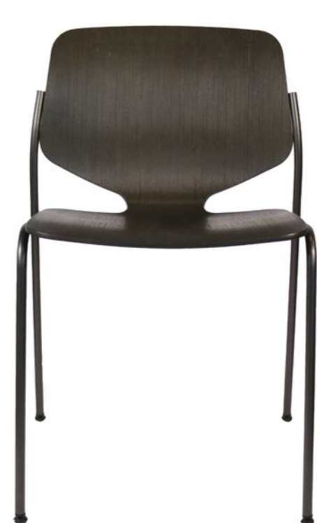
Denmark 03 The "Nova" chair is designed by ARDE design studio and manufactured by Mater Design