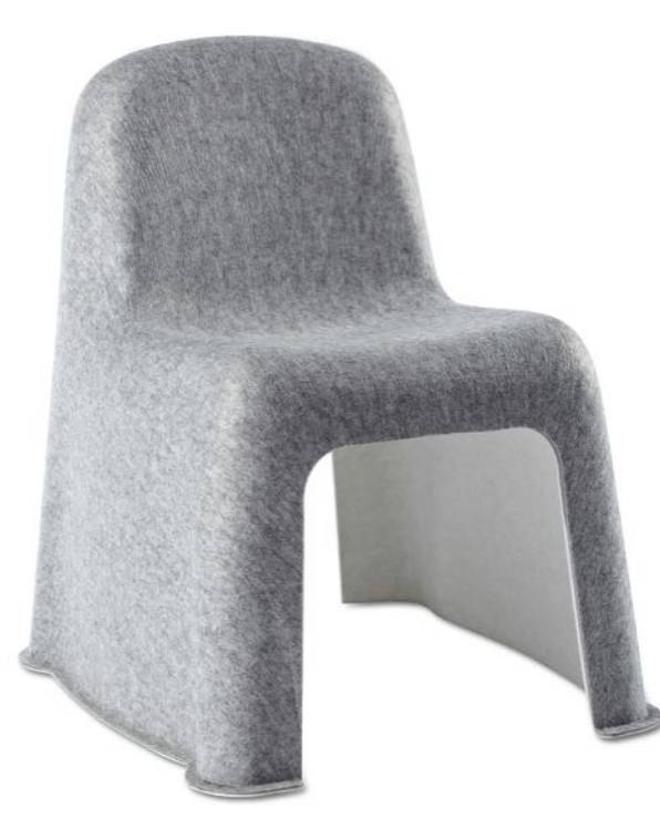
Denmark 06 The "NOBODY" chair is designed by KOMPLOT Design and manufactured by "HAY"