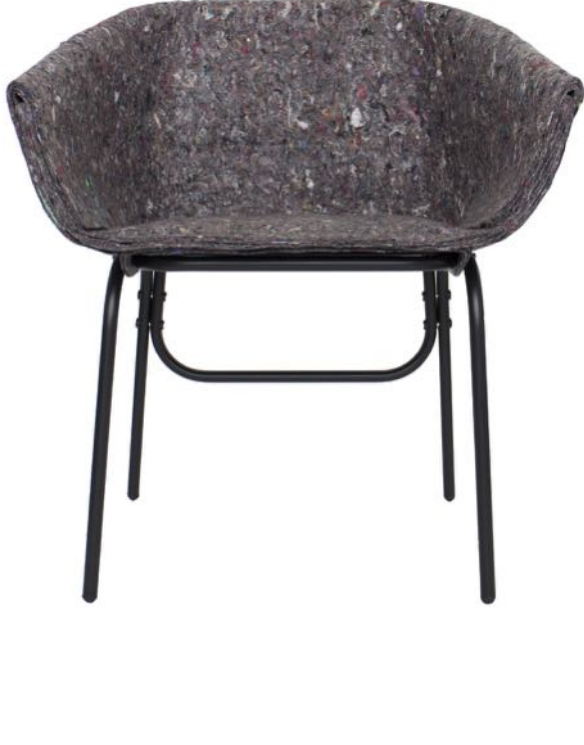
Finland 14 The "Fella" is designed by Tomi Laakkonen