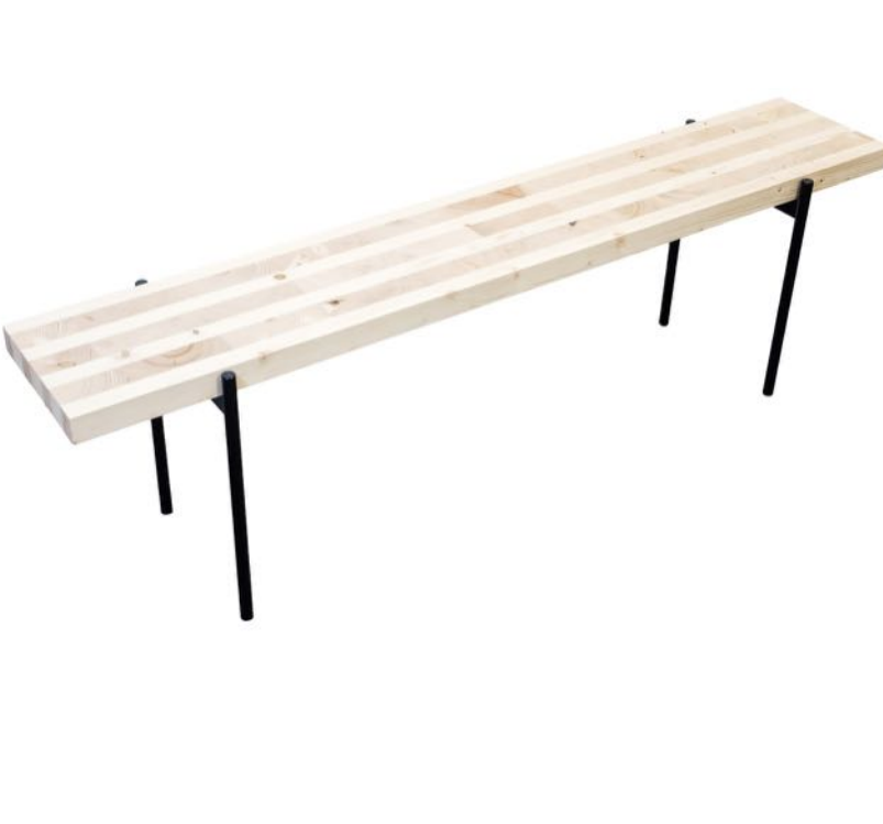
Finland 19 "MURU" is designed by Sami Matikka