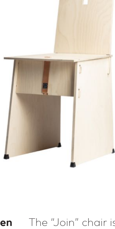
Sweden 43 The "Join" chair is designed by Sten Forsberg and manufactured by "Simply Design Sweden AB"