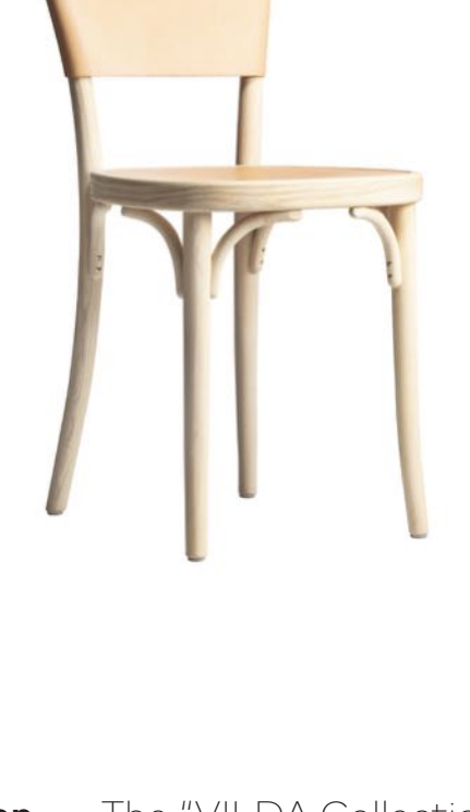
Sweden 40 The "VILDA Collection" chairs is designed by Jonas Bohlin and manufactured by "Semla Fabrikers AB"