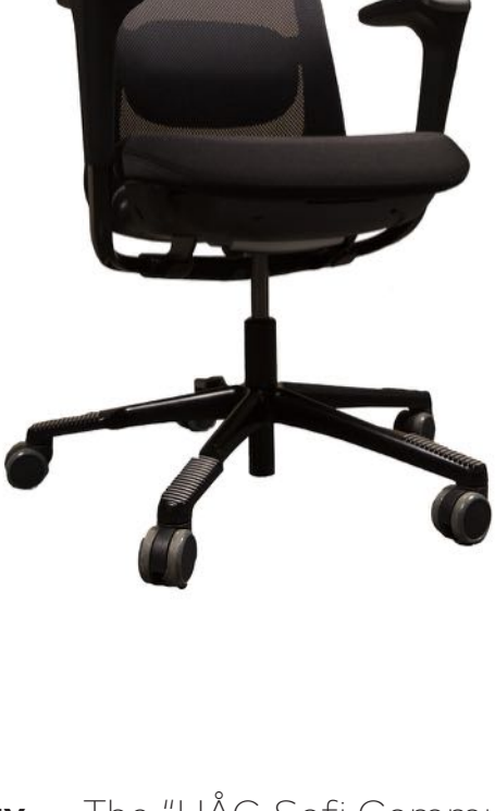
Norway 38 The "HÅG Sofi Communication 7502" chair is designed by Frost produkt, Powderdesign, Flokk design team and manufactured by "HÅG/Flokk"