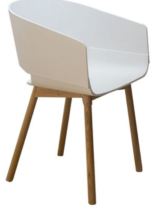
Finland 10 The "One3 - prototype" chair is designed by Jesse Pietila