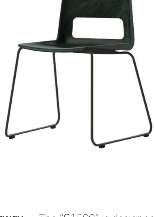
Norway 37 The "S1500" is designed by Snehetta and manufactured by "Nordic Comfort Products NCP"