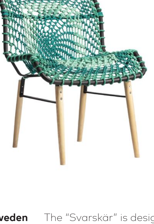
Sweden 48 The "Svorskar" is designed by Hampus Penttinen