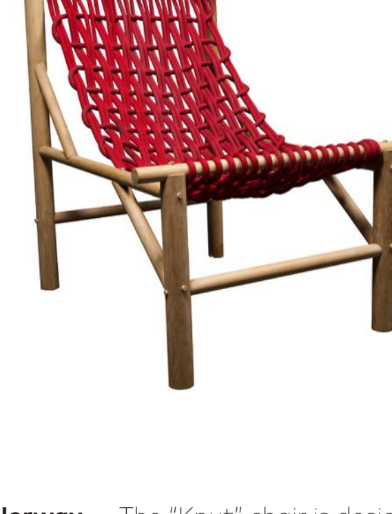
Norway 39 The "Knut" chair is designed by Jette Graener