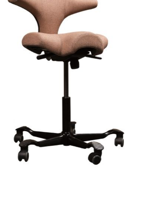
Norway 33 Winner The "HÅG Capisco" is designed by Peter Opsvik and manufactured by "HÅG/Flokk"