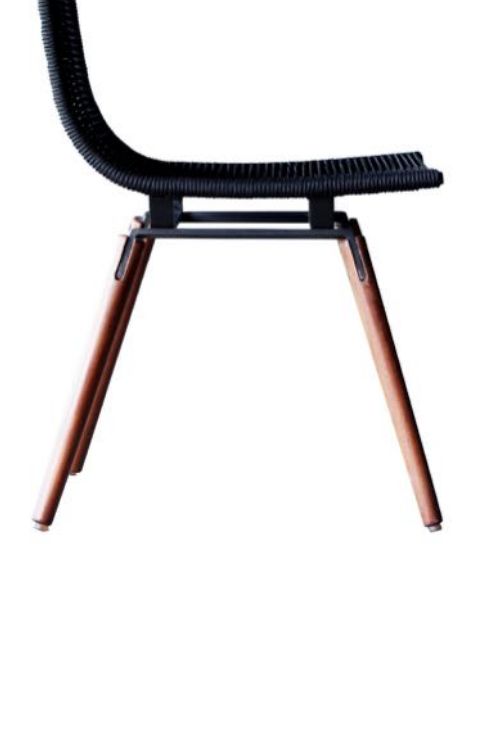
Norway 36 The "Tropchair" is designed by Jacob Amtrup and manufactured by "DAFI Tropic Furniture Factory"