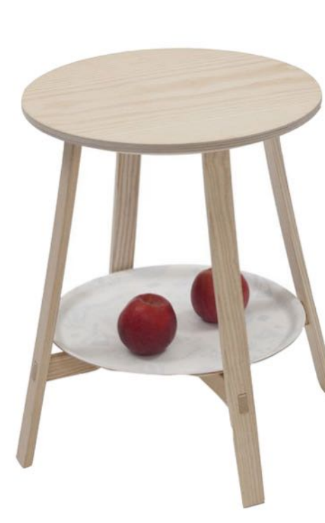
Finland 11 The "pikku tikku - STOOL" is designed by Pekki Haru and manufactured by "Vivero Ltd."